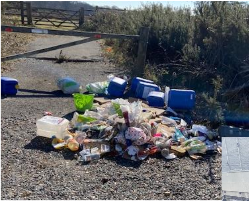
Non CRM or unreported fly tipping